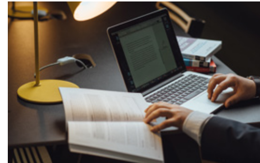
LAUNCHPAD AT YORK ST JOHN UNIVERSITY