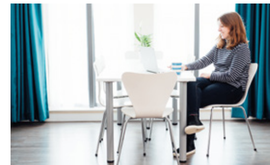
| ST JOHN CENTRAL

Get in touch with Accommodation Services for more information. See pictures of our accommodation sites and costs online, or come and visit the Campus, on an Open Day (see pages 2-3 for more information) and take an accommodation tour whilst you're here. www.yorks.ac.uk/accommodation