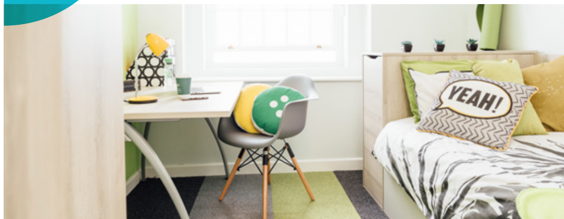
| LIMES COURT