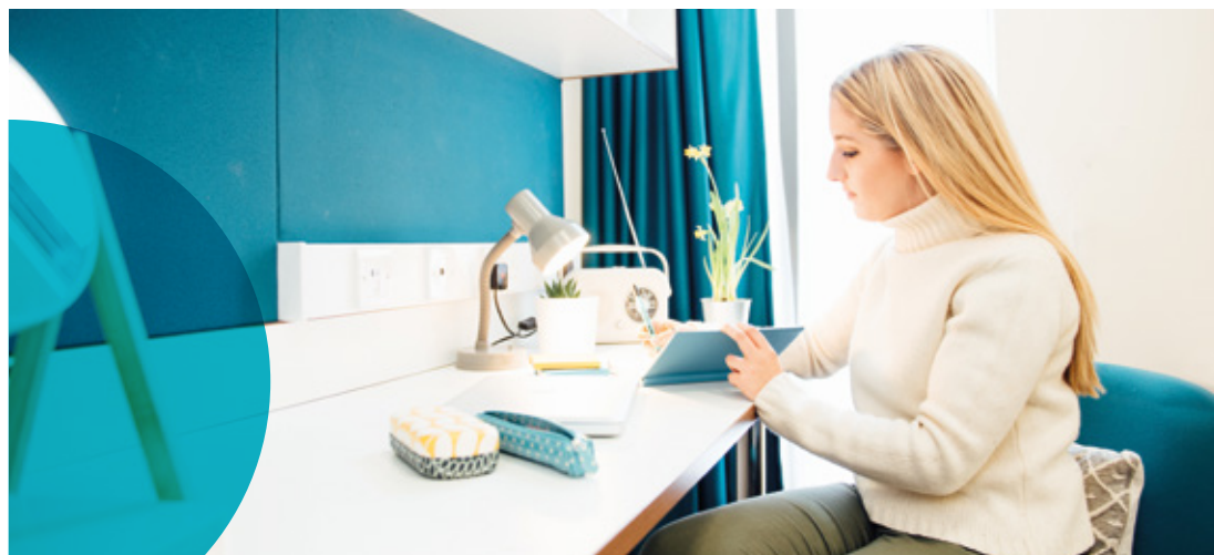
| PERCY'S LANE

YORK IS A FANTASTIC PLACE TO CALL HOME AND WE HAVE A GREAT RANGE OF ACCOMMODATION OPTIONS AVAILABLE TO SUIT YOUR LIFESTYLE.