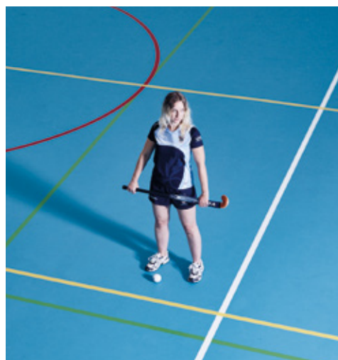
OVER 60 CLUBS AND SOCIETIES TO JOIN

WE KNOW THERE IS MUCH MORE TO UNIVERSITY LIFE THAN STUDYING AND WE KNOW HOW IMPORTANT IT IS TO ACHIEVE A BALANCE WORK AND PLAY.