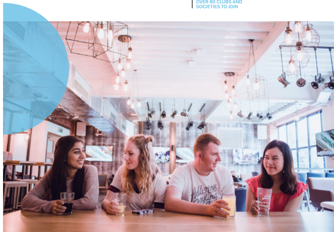
STUDENTS' UNION BAR