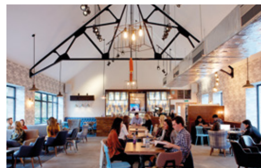
STUDENTS' UNION CAFE